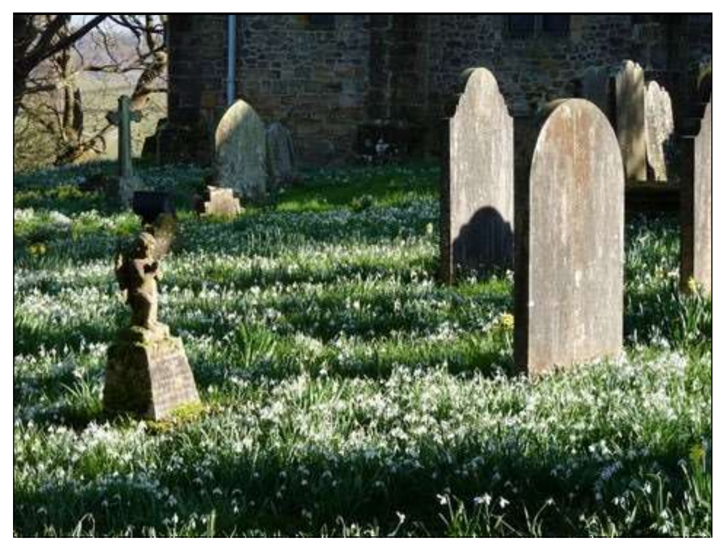
Snowdrops, Lamberhurst Church Alan Whitson