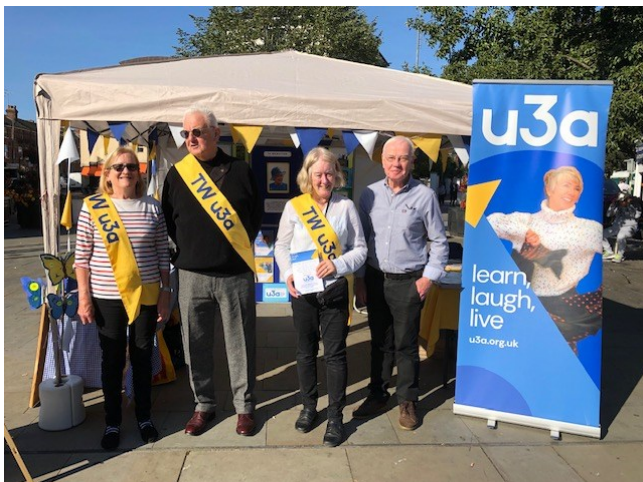
Last year's display

Promotional leaflets are available from Eryll .