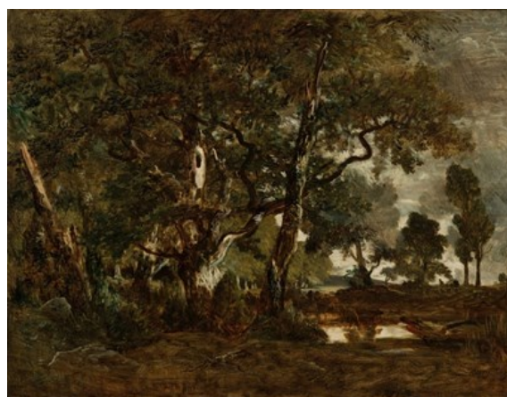
The Forest in Winter at Sunset by Théodore Rousseau